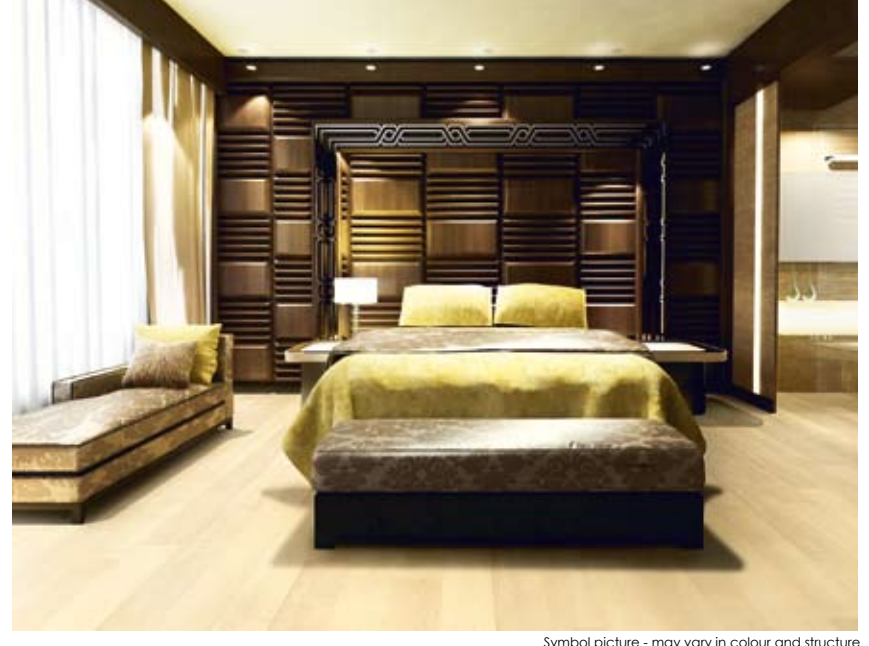
Symbol picture - may vary in colour and structure