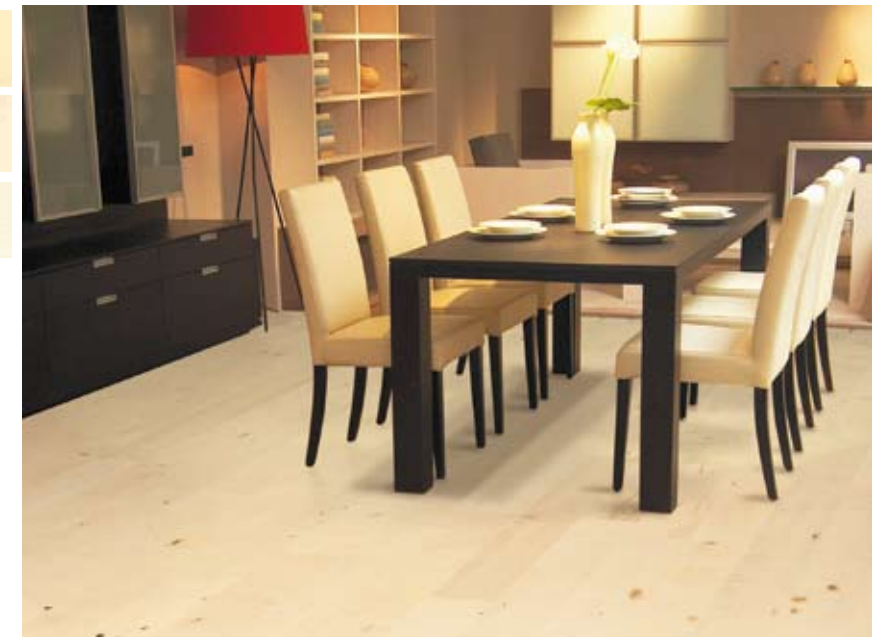
Symbol picture - may vary in colour and structur