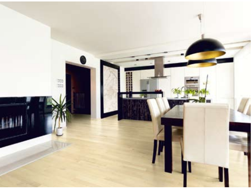
Symbol picture - may vary in colour and structur