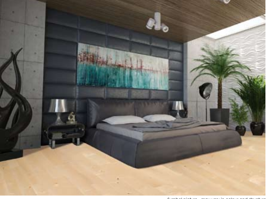
Symbol picture - may vary in colour and structure