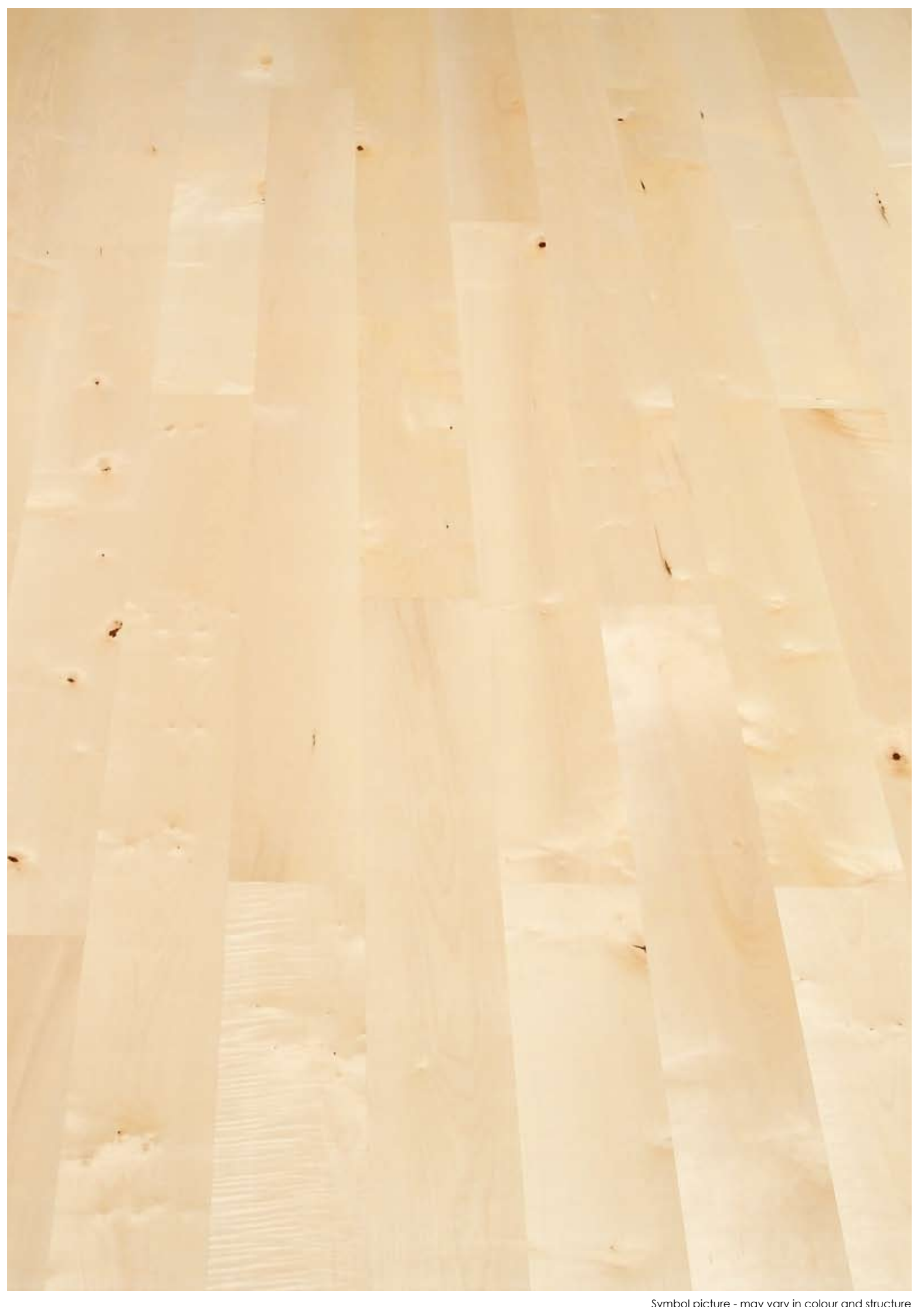
Symbol picture - may vary in colour and structure