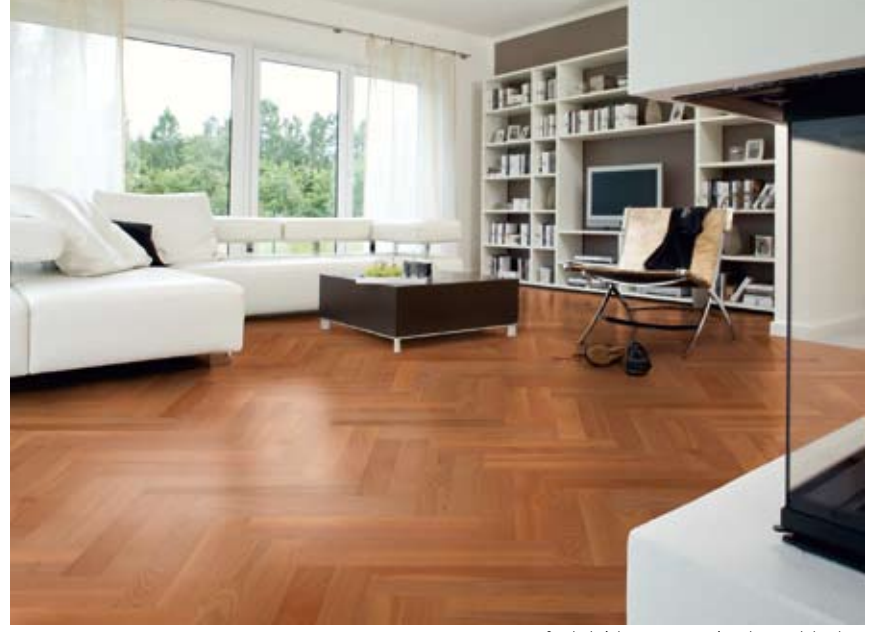
Symbol picture - may vary in colour and structure