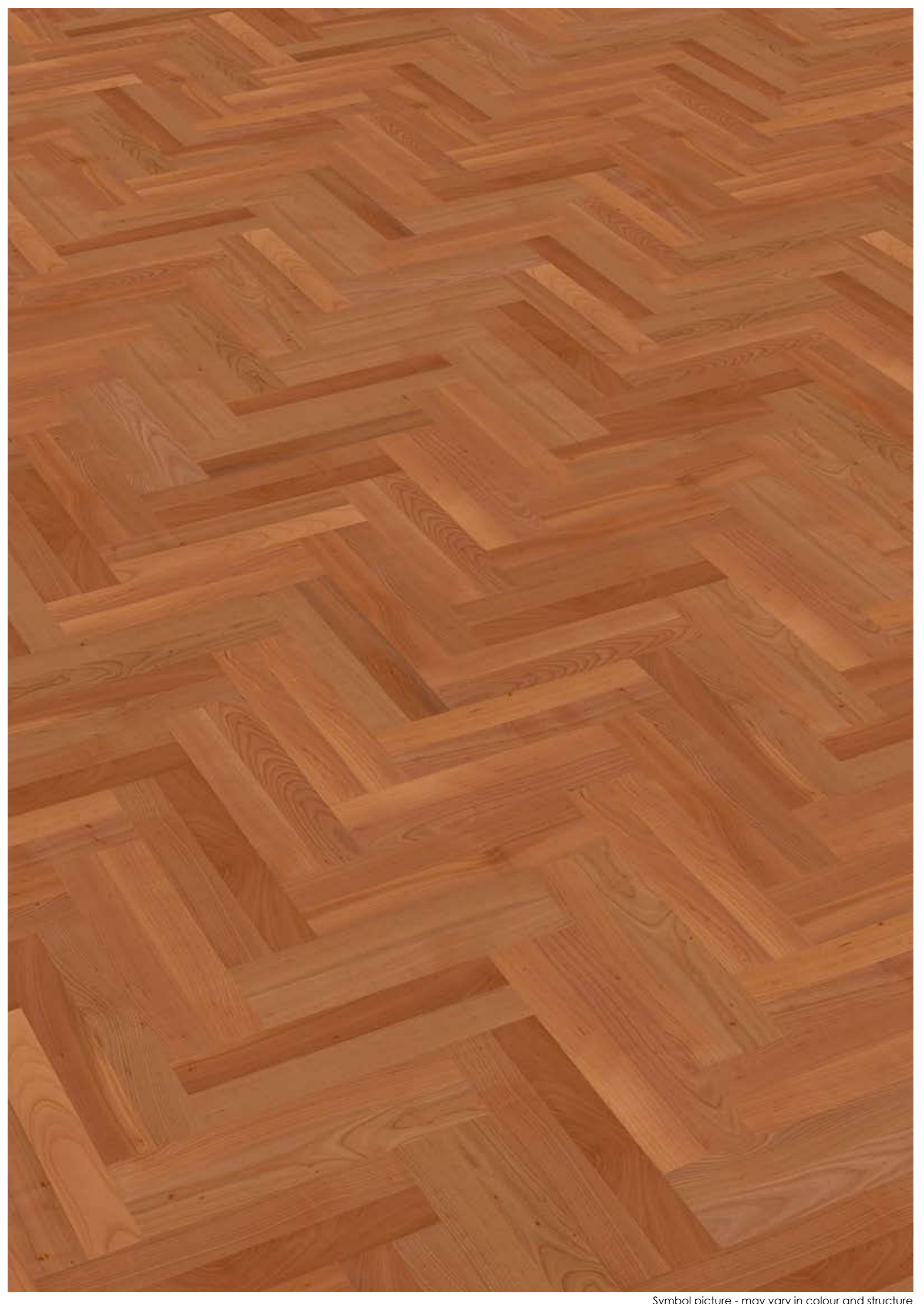
Symbol picture - may vary in colour and structure