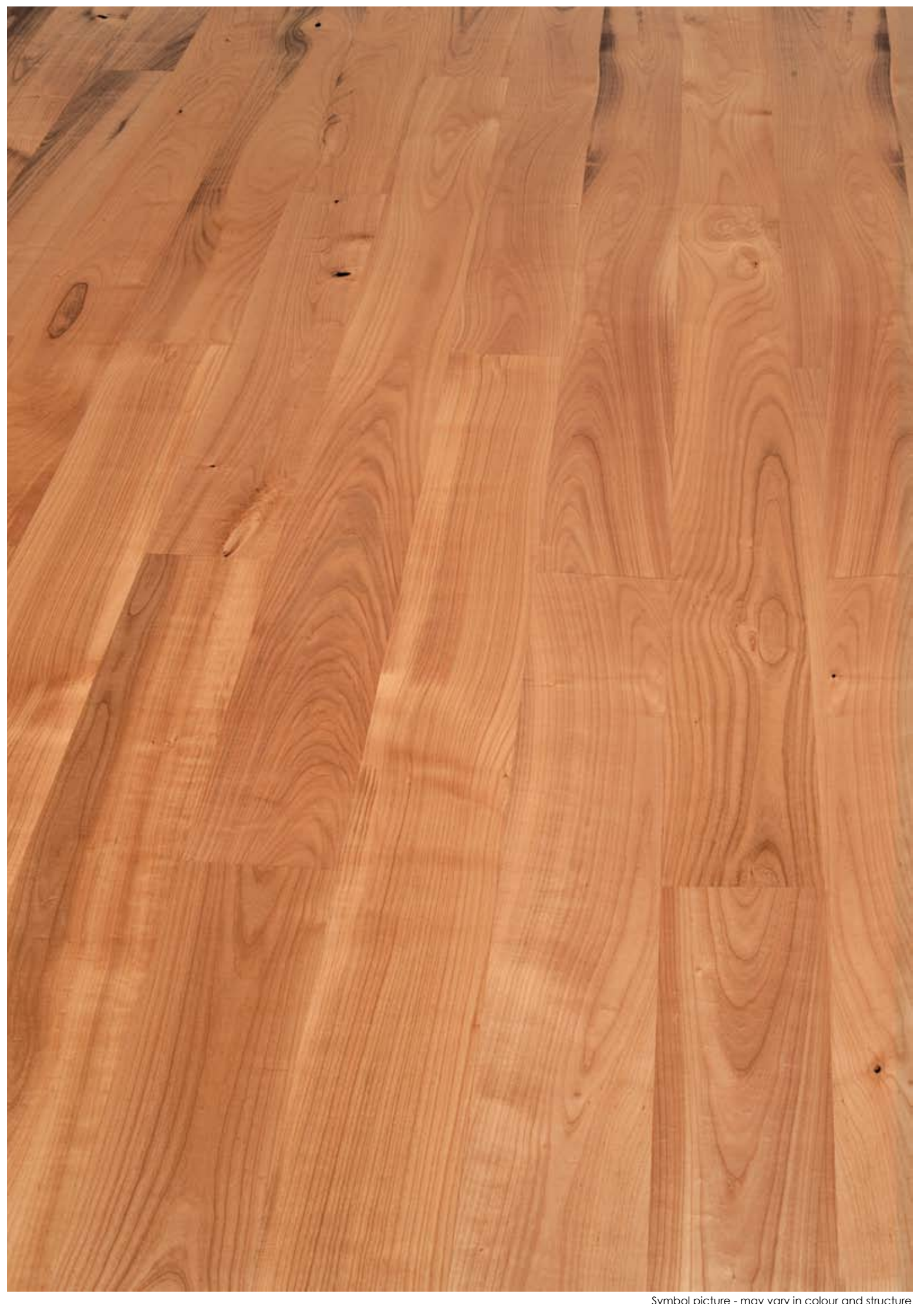
Symbol picture - may vary in colour and structure