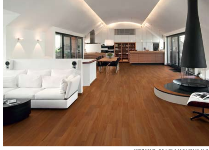
Symbol picture - may vary in colour and structure