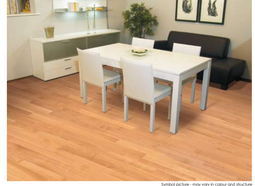
Symbol picture - may vary in colour and structure