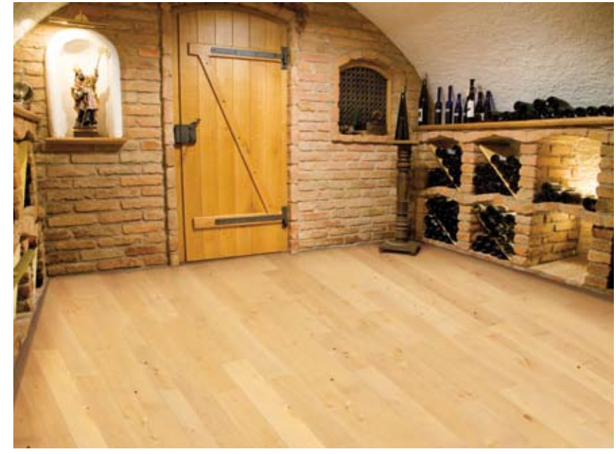
Symbol picture - may vary in colour and structure