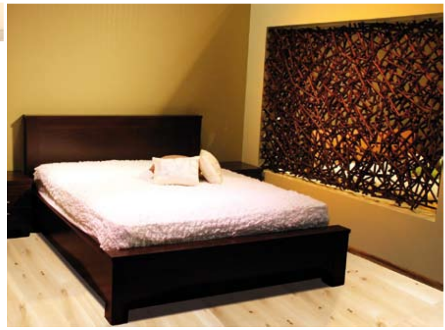
Symbol picture - may vary in colour and structure